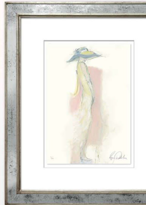
Poppy Waddilove 1920s Fashion