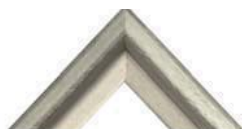
624L - Contemporary Silver w/ Linen Slip