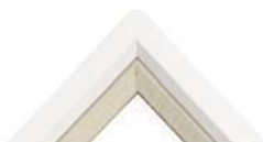
612L - Contemporary White w/ Linen Slip