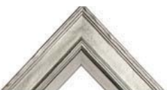
803L - Gesso and Silver w/ Linen Slip