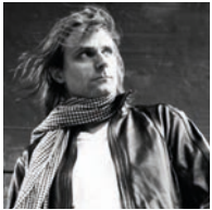
Eddie Lawrence Mick Jagger III

Eddie Lawrence's pop-art inspired portrait of icon Mick Jagger channels the energy of rock and roll, and creates commentary on the oversaturation of the media and repetition of reporting. It captures Jagger's unmistakable likeness in a style akin to that of Andy Warhol, layering collage and mixed media to form a dynamic composition. Pop culture and artistic innovation collide in this electrifying tribute.